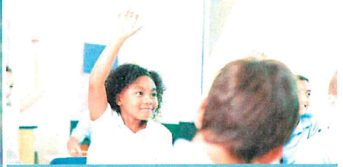
Strengthen the Faith