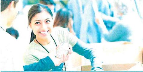
Serve the Poor